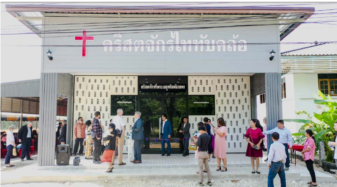
The Chapel sponsored the Thai Tubkhlo Church through FJCCA. Wes and his team were able to attend the dedication in the fall of 2019.