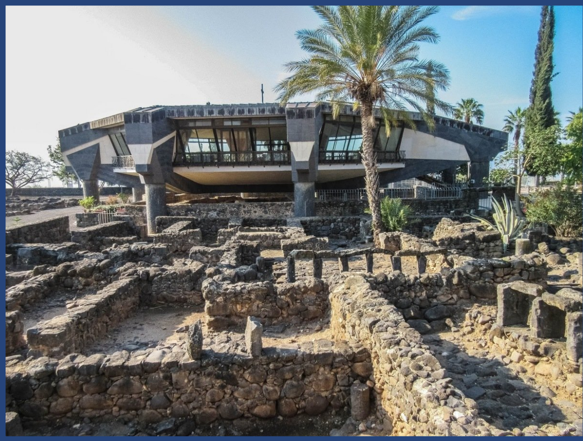
Church and House of Saint Peter Capernaum, Israel