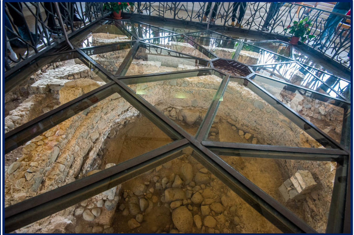
Church and House of Saint Peter Capernaum, Israel