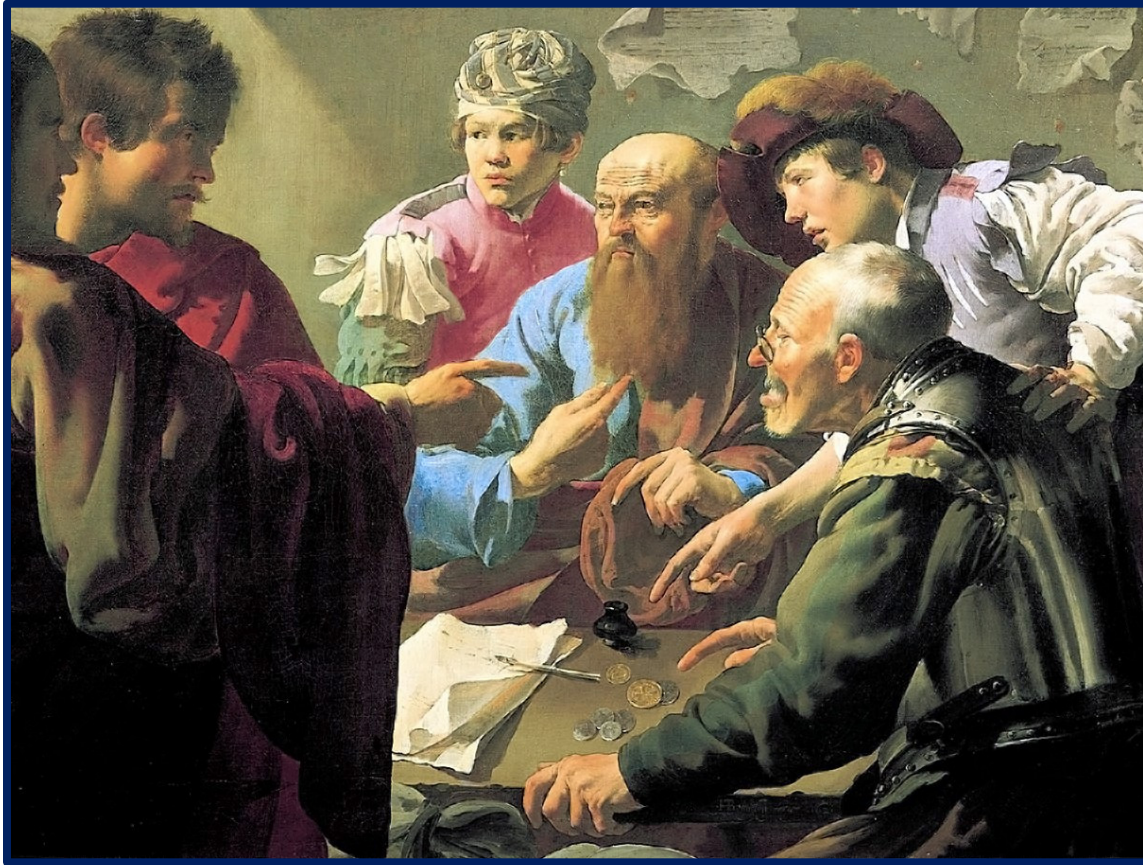
Hendrick ter Brugghen, 1588-1629