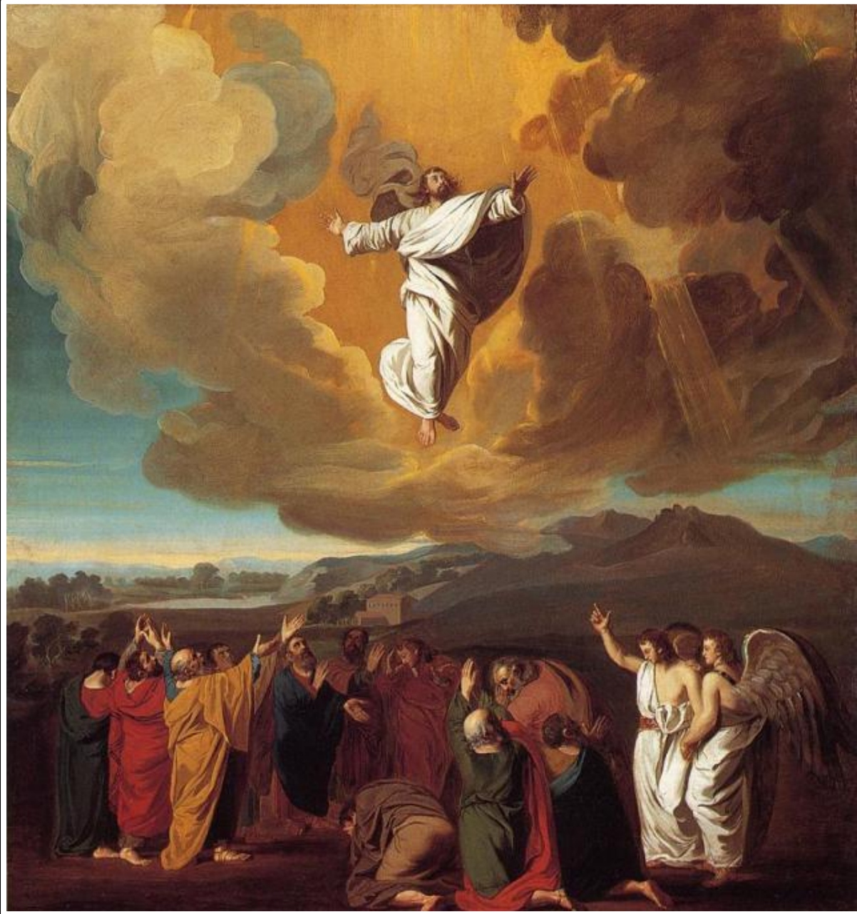
“The Ascension” by John Singleton Copley