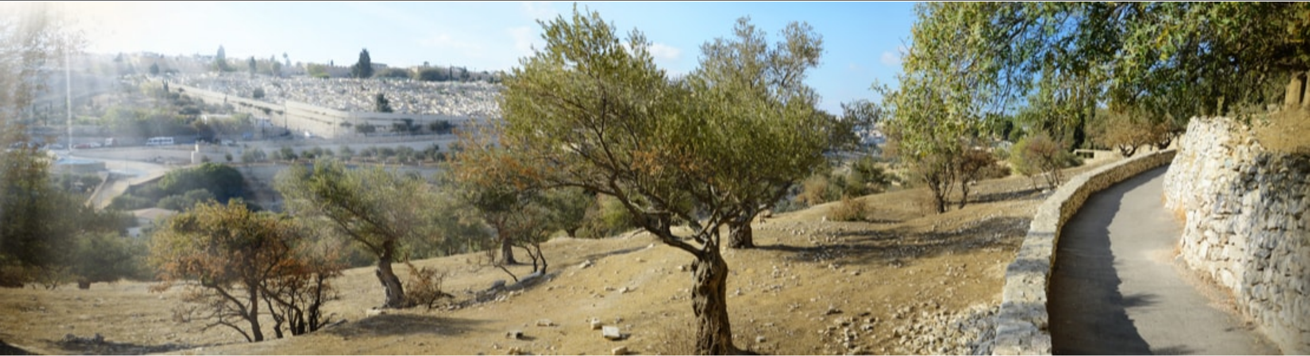
The Garden of Gethsemane