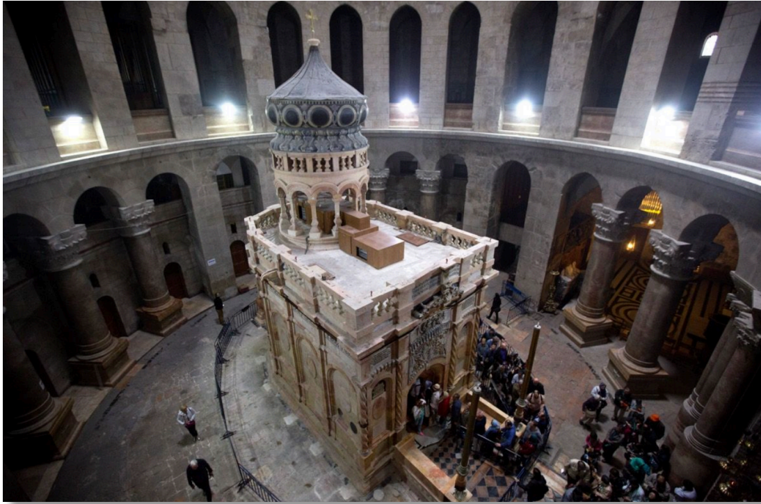
Church of the Holy Sepulchre, Jerusalem