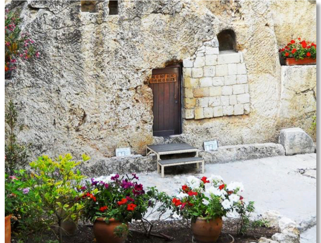
The Garden Tomb, Jerusalem